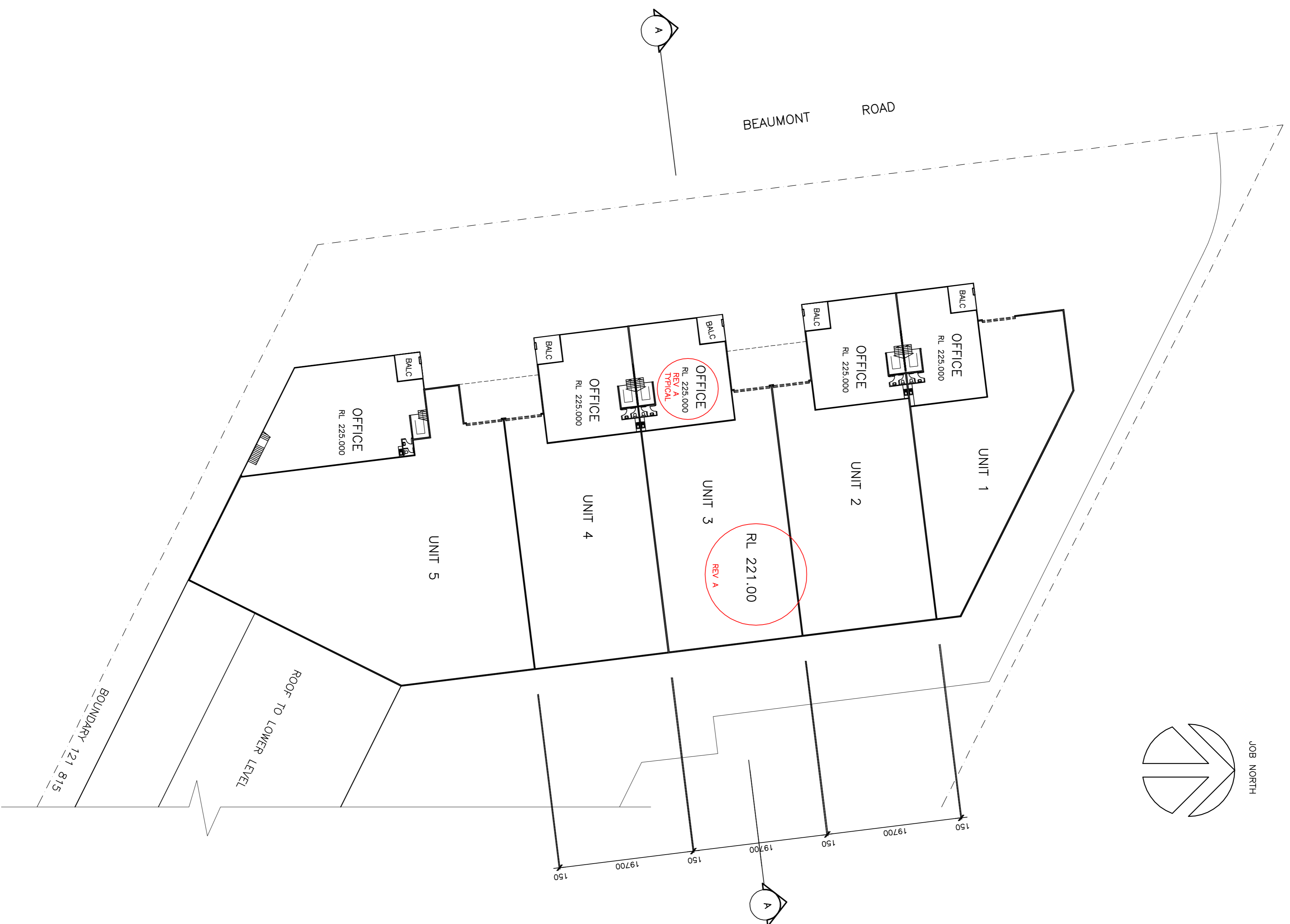
UPPER LEVEL MEZZANINE FLOOR PLANS